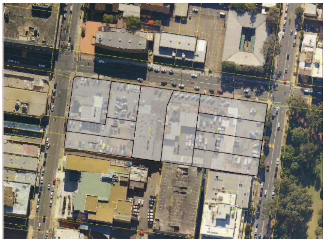
Figure 1: Aerial photograph of the subject site

This planning proposal seeks to rezone land at 133 Bigge Street, 26-28 Elizabeth Street and 148 George Street, Liverpool, being Lots A, B, C & D in DP 337604, Lots 2 & 3, DP 700219, Lot 1 DP 217460, Lot 1 DP 516633, Lot 4 DP 592346 and Lot 10 DP 621840. The subject site comprises 1.018 hectares of urban land within the Liverpool City Centre identified in Figure 1.